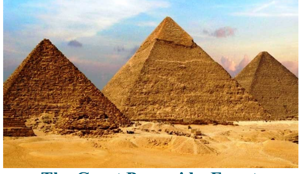
The Great Pyramids, Egypt